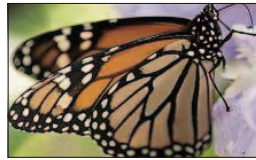
Florida Museum of Natural History

One of my ideas is that it's probably exotic predatory ants, like the red imported fire ant and the Mexican twig ant and the little fire ant. These are three invasive exotic species that were first reported in Florida in the 1970s, and it was around in the 1980s we first started noticing butterflies starting to disappear. And it's not too different from the Burmese pythons that are now loose and rampaging in South Florida, eating all the birds and mammals. But, you